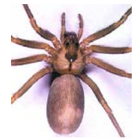
Brown Recluse · Violin Shaped Mark · Six Pair of Eyes · Soft Bite → Immense Pain · Immediate Medical Attention