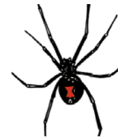
Black Widow · Red Hourglass Mark · Soft Bite · Immediate Medical Attention