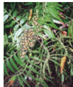
Poison Sumac · 13-Leaflets · Grows in Standing Water